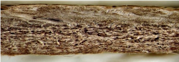
Section of leather from wool-bearing sheep showing delamination.