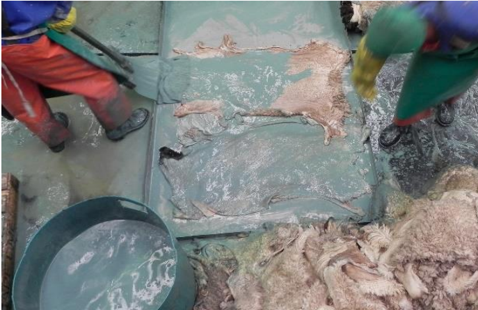
Skins piled to enable “paint” penetration to the hair root.