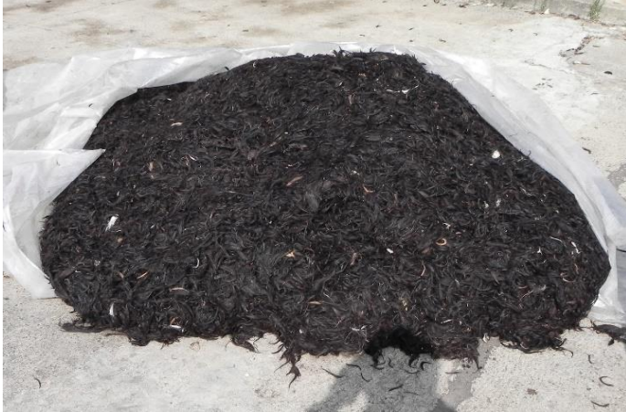
Compressed and baled hair.